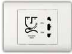
AAKX6006 + X0703