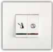
AAKX6002 + AAKX6004 + X0702